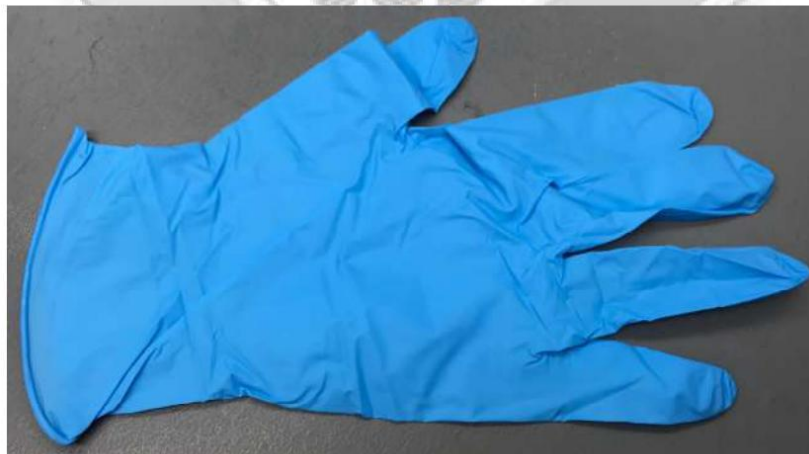
Photo : Disposable Nitrile Glove, Size M