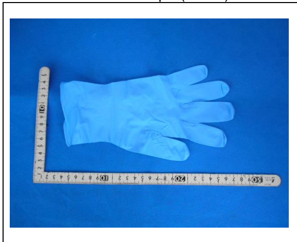
Received sample (Size S)