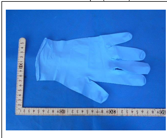
Received sample (Size M)