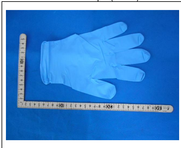
Received sample (Size L)