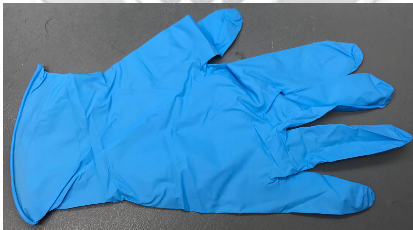
Photo : Disposable Nitrile Glove, Size M